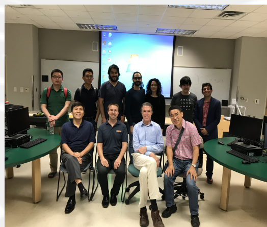
2018 SMSS Undergraduates and Graduates Research Workshop, Edinburg, May 5, 2018